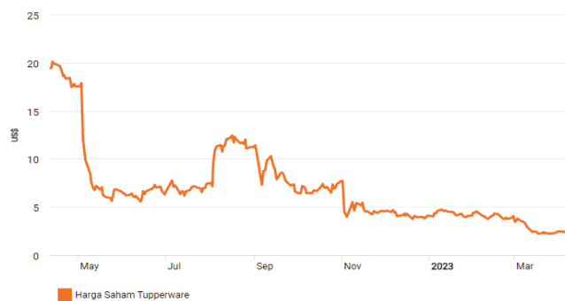
Figure 1. Decrease in Tupperware Brands Corporation Shares

In a few years final the Tupperware company experienced issue bankruptcy that occurred because exists decline price share sale of Tupperware on the US stock exchange. Based on Yahoo Finance data, price Tupperware shares amounted to US$1.3 at closing trading Tuesday, April 11, 2023. The figure plummeted 93.29% in comparison with same period year earlier (year-on-year/yoy). Tupperware shares also fell 68% if compared to with early 2023 (year-to-date/ytd). Decline share can be seen in graphics in pictures under this :